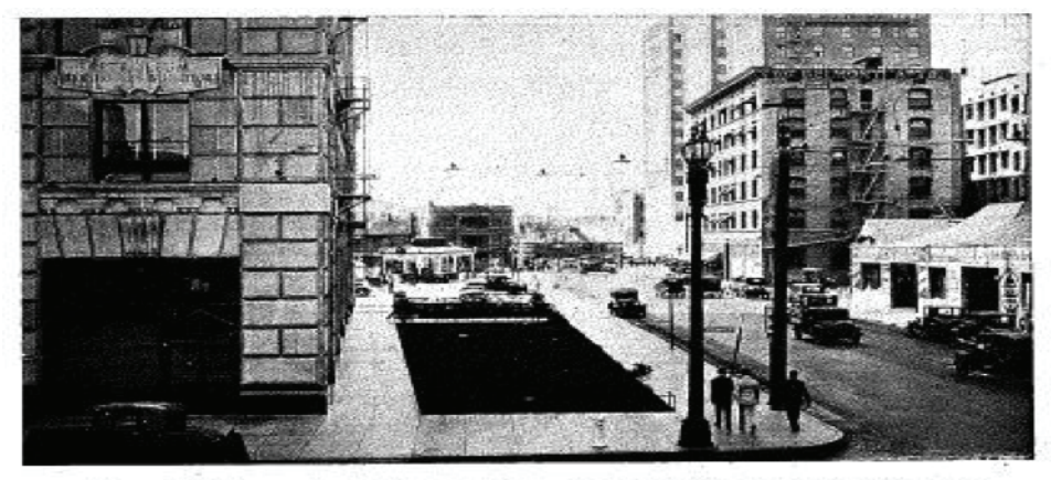
Olympic Boulevard and Flower Street, 1929, Set-Back Ordinance Effective

Supreme Court 1949). Although the court asserted that wider streets would alleviate traffic, it provided no evidence to that effect. Nevertheless, the decision reinforced the new consensus in Los Angeles and elsewhere that cities should address congestion by accommodating the automobile and that developers, not drivers, should make those accommodations.