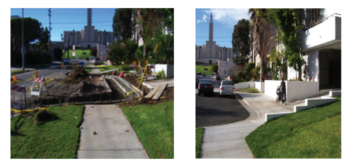
Figure 2: Street dedication and improvement, West Los Angeles.

A further issue is that dedications are parcel-level mitigations and only widen streets in front of particular developments. Even if streets were close to capacity and endogeneity was overcome, dedications might still not yield uniformly wider streets. Figure 3 shows a typical dedication and improvement. One parcel is redeveloped, so only the street in front of that parcel is widened. The resulting increment of street is useless for moving vehicles, and becomes additional (free) on-street parking. But the city has already required the developer to build off-street parking (Los Angeles has minimum parking requirements; the driveway is visible in the second image), so even the new parking delivers few benefits.