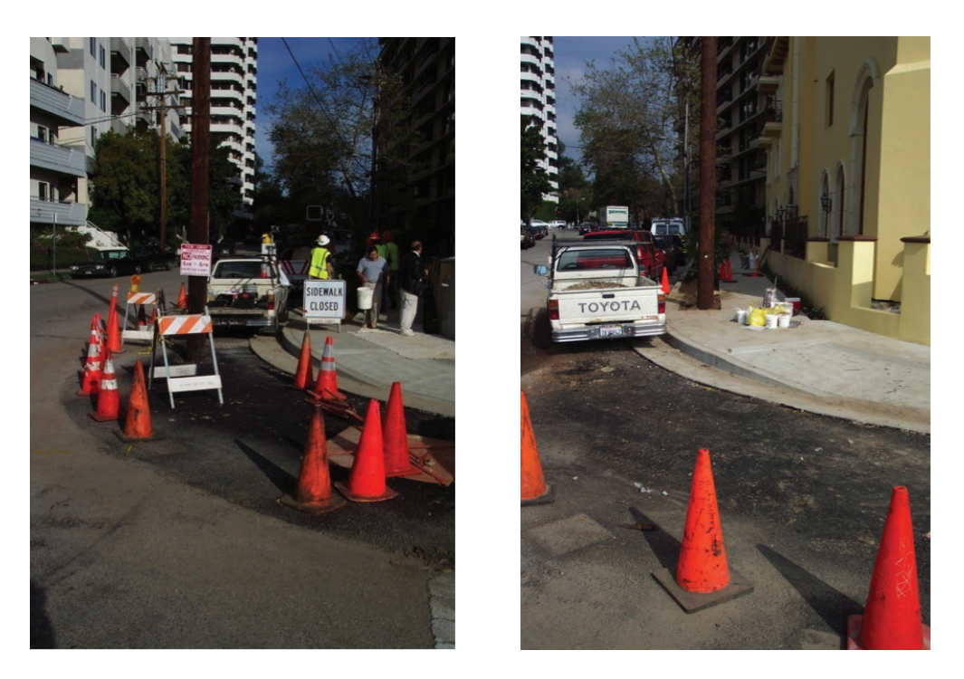
Figure 3: Street improvement that required moving a telephone pole.

The most that can be said is that widenings can be quite burdensome, and their burden is often greatest on small parcels, where the cost can be spread over fewer units. Figure 3, for example, shows a 6,000-square-foot dedication where the improvement cost about $450,000, and required moving utility poles, trees, a fire hydrant, the curb and gutter, and the sidewalk itself. The developer had originally proposed 10 units but says the dedication and improvement costs reduced that number to nine. This statement may or may not be correct, of course, but in either case the improvement cost about $175 per square foot of street, or about $50,000 per unit.