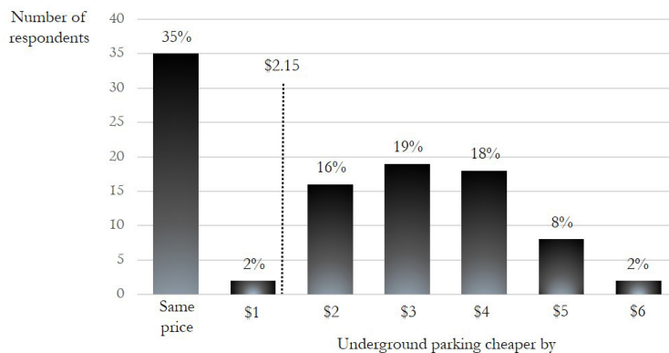
Figure 3: Willingness to pay extra for on-street parking

The convenience of on-street parking in accessing shops and restaurants around the area of interest is a significant determinant of parking behavior (Kobus et al., 2013). Another dimension of interest is the ease of exiting the parking facilities within the convenience factor, especially following larger crowd events—concerts, sports events etc. This accessibility factor is an important consideration for travelers in parking choice. The last question of the survey asked the respondents at what price difference would they use the underground parking as the first choice (Q11). Figure 3 illustrates the responses.