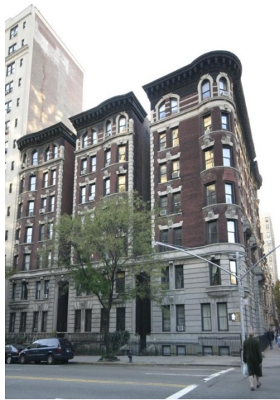
b. Elevator apartment