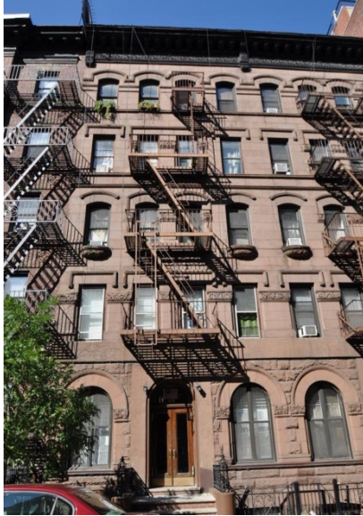
a. Walkup apartment