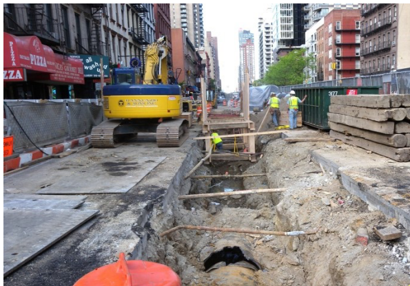
Cut and Cover on 83 rd St