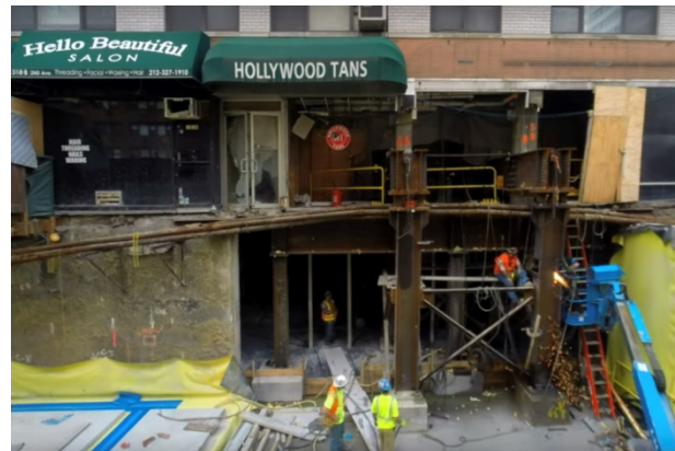
Construction on 2 nd Ave