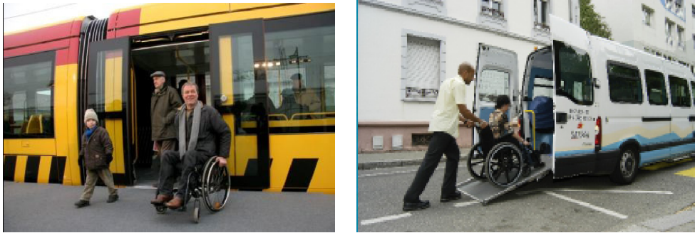
Figure 2: Tramway and specialized transport means in Mulhouse, part of the PDU measures

For the PDU revision (2004–2005), the strong points were the introduction of an accessible tram service that entered service in May 2006 (Figure 2), a tram-train project (open by stages from 2007 to 2011), and research for a system to provide information to PRMs.