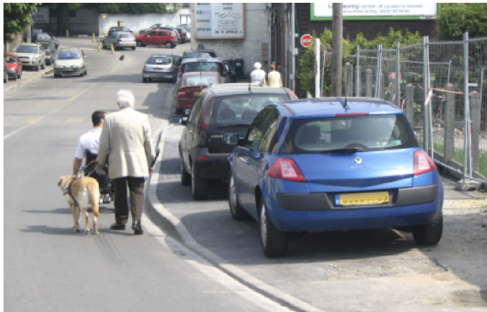
Figure 4: Example of mobility-impaired pedestrians at risk due to illegal car parking