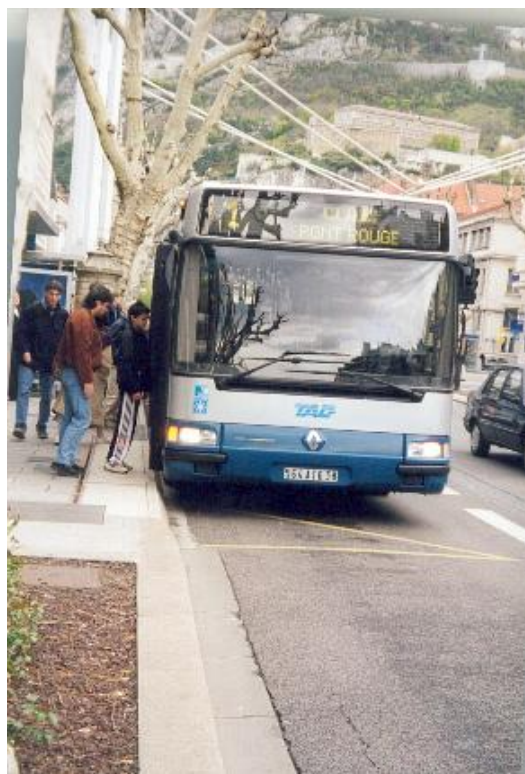
Figure 1: Accessible bus and bus stop in Grenoble